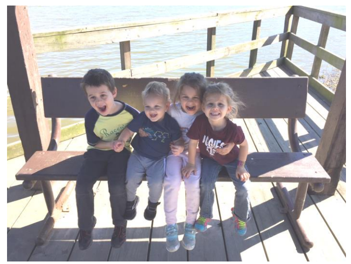
In another article two MDs ask for more <u>real</u> world data when it comes to predicting drug safety in children. The authors note that there are substantial gaps in the knowledge we have about

Children are among my favorite people, and I never want to see a child harmed because of uninformed prescribing of a medication. Two recent studies provide some insight into how well we children from potentially protect harmful prescription drugs. A MD summarized the findings from a large study of prescriptions given to children from 1999 to 2014. The good news was that the percentage of children having used a prescription in the past 30 days has dropped during that time from 25% to 22%. One of the major successes was the drop from 8% to 4% in prescriptions of antibiotics. This is likely due to the campaigns to reduce overprescribing of these drugs when the cause of illness is not a bacterium. Likewise, the prescribing of antihistamines has dropped from 4% to 2%; however, some of this drop may be due to increased availability of this class of drugs without a prescription. The increase in use of blood pressure medications from 0.2% to 0.8% could be due to increased treatment of high blood pressure in adolescents; however, this could be due to increased obesity in this group, which is associated with high blood pressure. The writer opines that additional examination of the data is needed to clarify details about trends in prescribing to children.